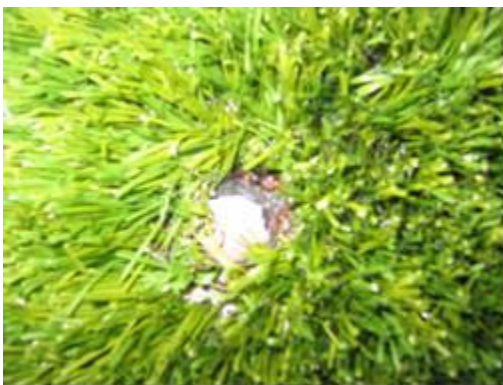
Sample with no infill

* Due to the fact that the backing caught on fire the test had to be aborted. To prevent the backing from burning and to test the flammability of the fibres only, a 20mm layer of sand was placed into the pile of the carpet, as per your instructions on the use of the carpet.